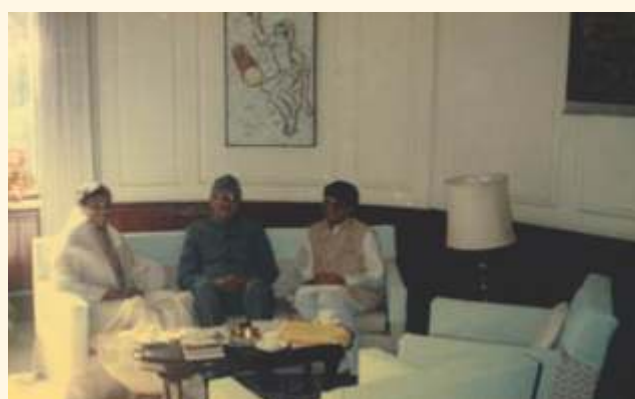
Chairman KCS with Indian Ambassador to Nepal.