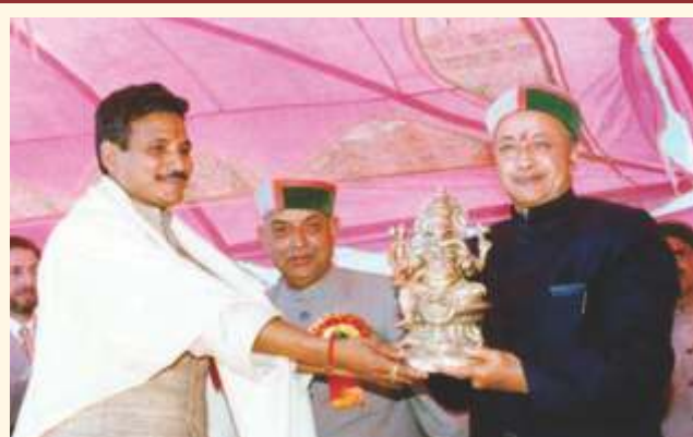
Chairman KCS with Hon'ble Chief Minister of Himachal Pradesh Shri Veerbhadra Singh and Union Cabinet Minister.