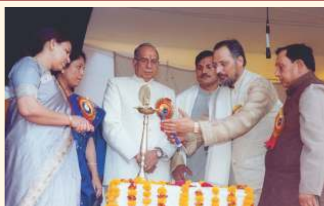
Chairman KCS with Lt. Gen. N.S. Malik and Hon'ble Education Minister of U.P.