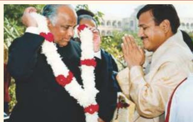
Chairman KCS with Hon'ble Union Minister Shri Sharad Pawar Ji.