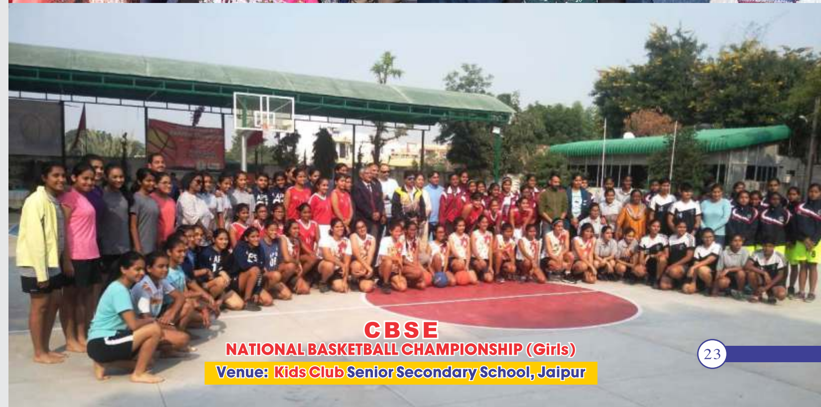
CBSE NATIONAL BASKETBALL CHAMPIONSHIP (Girls) Venue: Kids Club Senior Secondary School, Jaipur