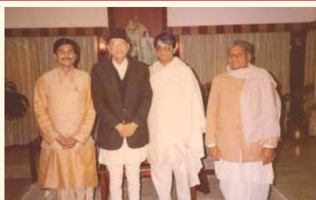
Chairman KCS Hon'ble Prime Minister of Nepal Shri G.P. Koirala.