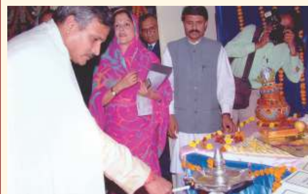
Chairman KCS with Smt. Yashodhara Raje Sindhia, Sports & Youth Minister, Govt. of MP.