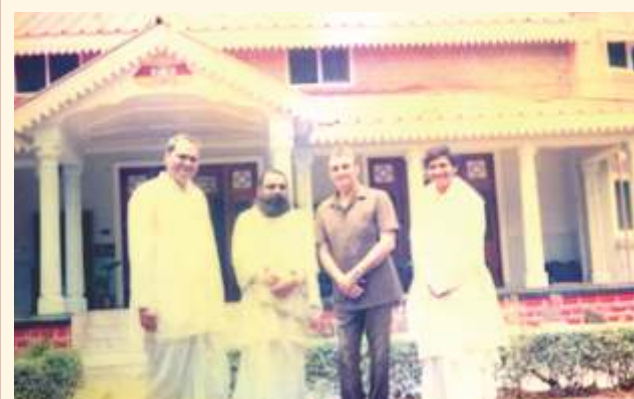
Chairman KCS with His Excellency Dr. Karan Singh Ji, Union Cabinet Minister.